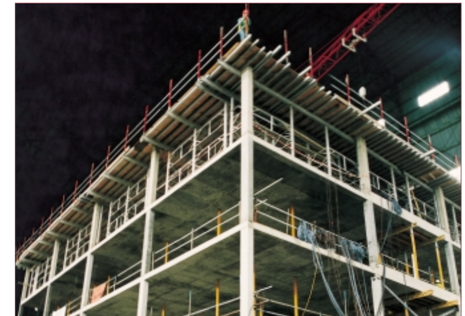
Figure 1: Table forms at Cardington

This Guide provides new and improved recommendations for striking formwork and gives new procedures for backpropping reinforced in-situ concrete flat slabs (less than 350 mm thick).